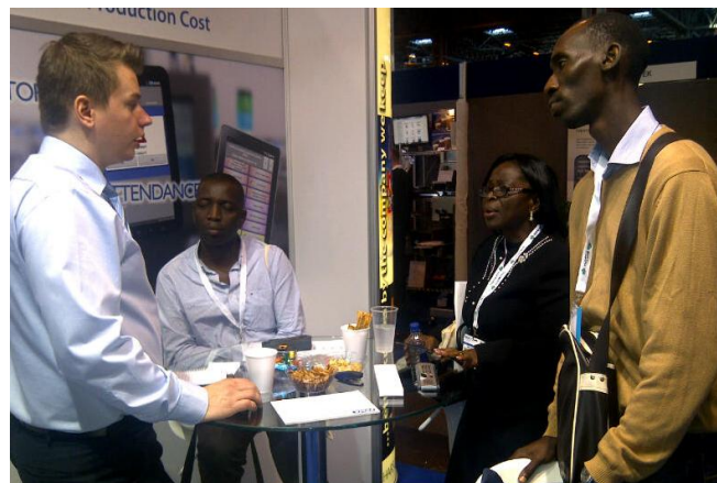
A presentation by the technical consultant at the show discussing the merits of his company's services on