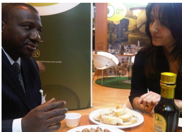
A delegate at one of the Food Processing & Packaging Trade visit in 2011