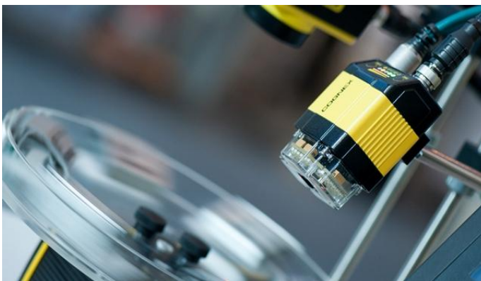
VISION IN ACTION!