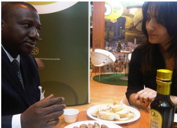
A delegate at one of the Food Processing & Packaging Trade visit in 2011