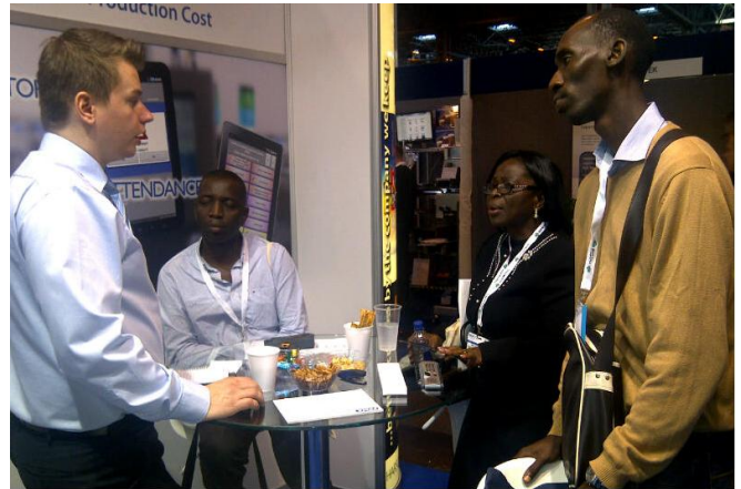
A presentation by the technical consultant at the show discussing the merits of his company's services on